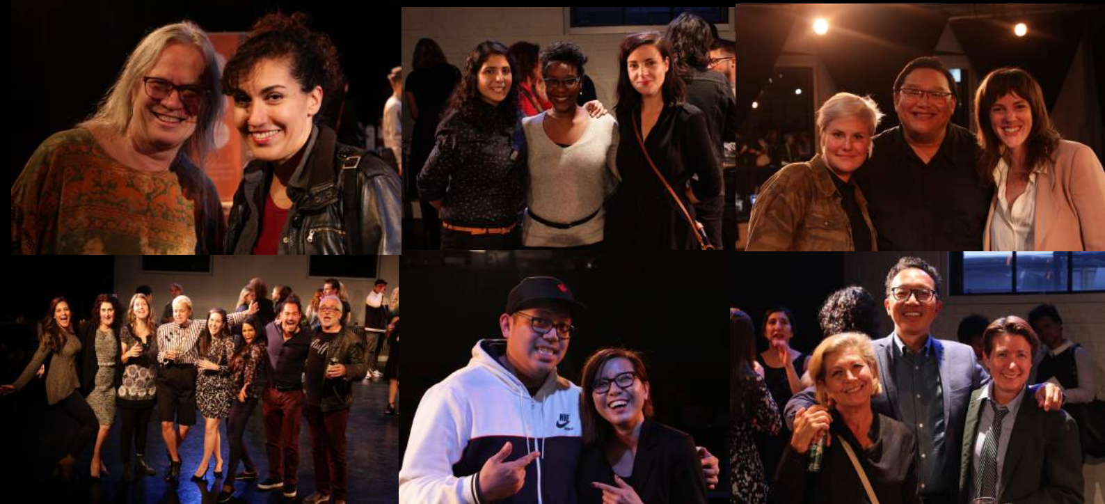
Photos from our 2018-19 Season Launch party

It is our belief that these conversations and contact points have enriched our audiences' experience of our works. We are proud of our ongoing endeavors to create deeper connections with the art, seeding investment with Nightwood's future offerings and in the culture our city has to offer.