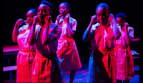
School Girls; Or, The African Mean Girls Play , winner of the 2019 Dora Award for Outstanding Production and Outstanding Direction

In 2020, Nightwood entered its fifth decade as the nation's leading feminist theatre company.