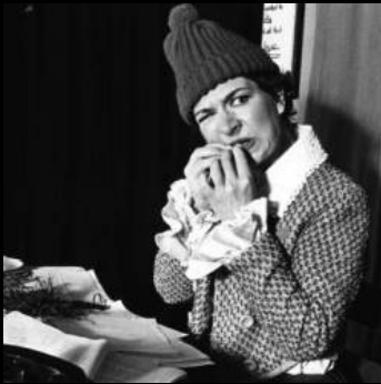
Good Night Desdemona ( Good Morning Juliet ) by Ann-Marie MacDonald, winner of the Governor General's Award