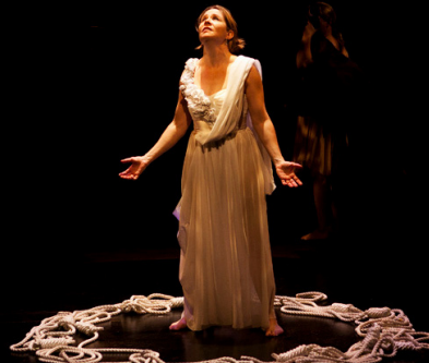
The Penelopiad , written by Margaret Atwood and starring Megan Follows - nominated for 6 Dora Mavor Moore Awards