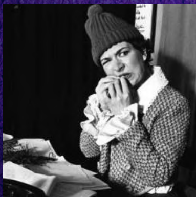
Good Night Desdemona ( Good Morning Juliet ) by Ann-Marie MacDonald, winner of the Governor General's Award