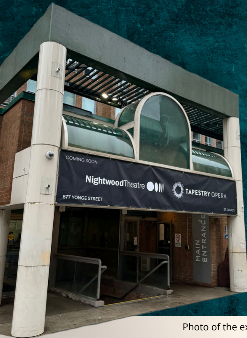
Photo of the exterior of 877 Yonge St