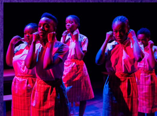
School Girls; Or, The African Mean Girls Play , winner of the 2019 Dora Award for Outstanding Production and Outstanding Direction