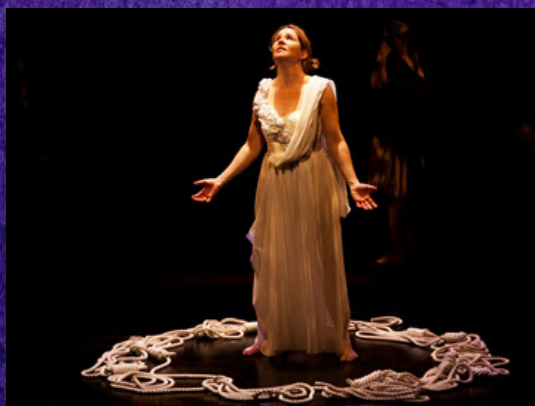
The Penelopiad , written by Margaret Atwood and starring Megan Follows - nominated for 6 Dora Mavor Moore Awards