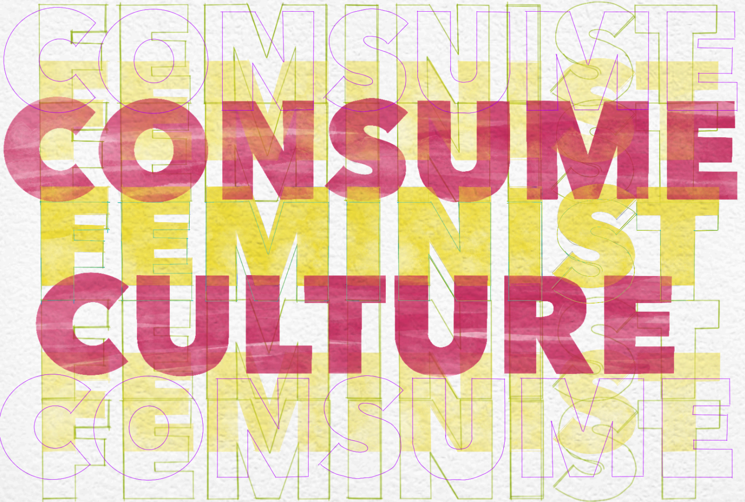
Original front & back cover logo design by Michelle Tracey